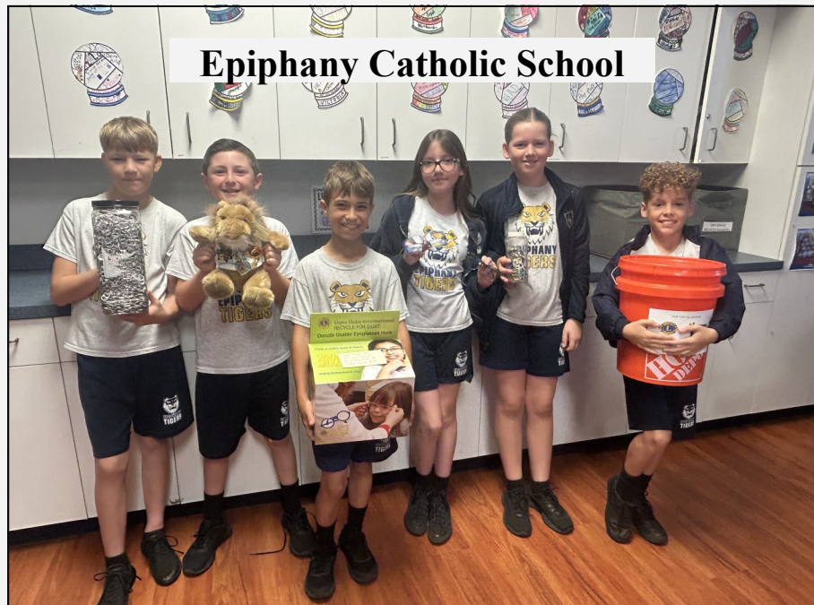
Epiphany Catholic School