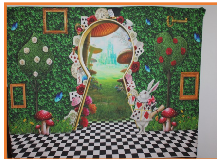
"Alice in Wonderland 2025"

A very special thanks goes out to all Lions who worked diligently over the past months to make this fundraiser a success.