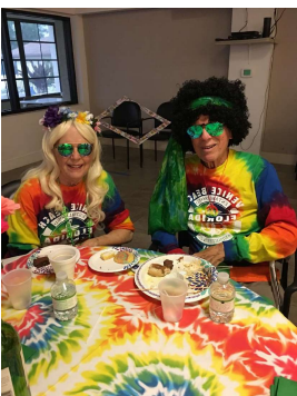
Here's a blast from the past... Our Woodstock Social in 2018

We have an amazing legacy to continue and we look forward to another successful Mane Event.